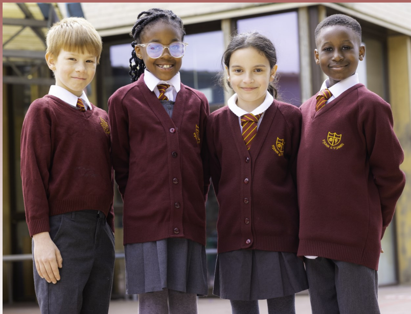
St John and St James School Uniform

It is proven that high expectations of school uniform improve performance and behaviour in school. At St John and St James we insist on full school uniform and school PE kit on designated days. If for any reason you are unable to provide this for your child, please speak to us in confidence.