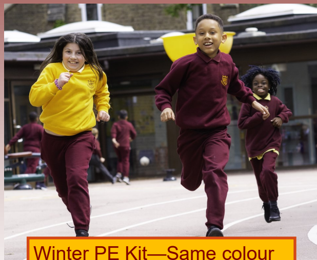
Winter PE Kit—Same colour shorts and polo for the Summer months